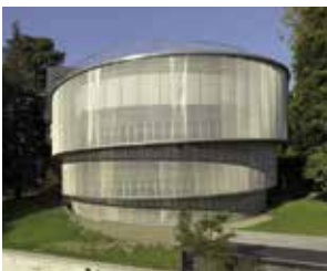
Rentenanstalt/Swiss Life 1,000 m 2 Cocoon Seefeldstrasse 287, Zurich