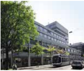
Allianz Suisse Immobilien AG 4,800 m 2 Bleicherweg 19, Zurich