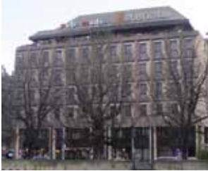
Publigroupe SA 4,600 m 2 Neumühlequai 6, Zurich

A selection of clients who assigned SPG Intercity exclusively for the letting.