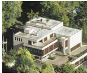
FIFA 1,600 m 2 Sonnenberg, Zurich