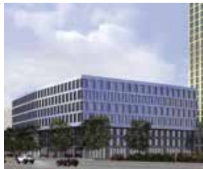
Union Investment Real Estate GmbH 20,500 m 2 Pfungstweidstrasse 51, Zurich