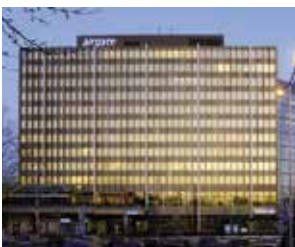
Barana Limited 20,000 m 2 Thurgauerstrasse 40, Zurich