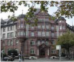
Rentenanstalt/Swiss Life 6,500 m 2 General Guisan Quai 38, Zurich