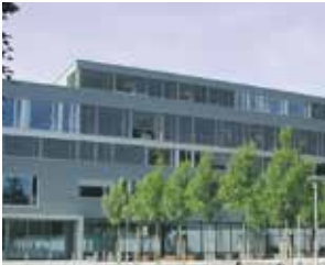
Bär & Karrer AG 4,000 m 2 Brandschenkestrasse 90, Zurich