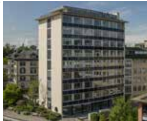
Euro Real Estate Swiss S.à.r.l. 2,500 m 2 Bärengasse 29, Zurich