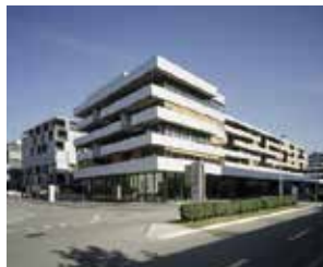
Integra Immobilien AG 4,200 m 2 Integra Square, Wallisellen