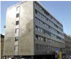
Diethelm Keller Holding AG 750 m 2 Mühlebachstrasse 20, Zurich