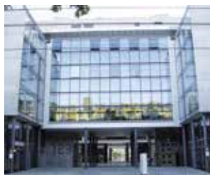
Hardturm Immobilien AG 25,000 m 2 Hardturmstrasse 123-129, Zurich