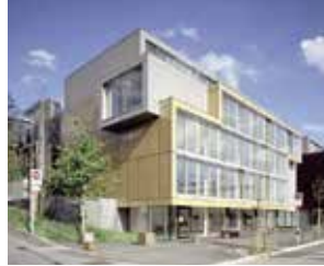
Rentenanstalt/Swiss Life 4,100 m 2 Seewürfel, 8008 Zurich