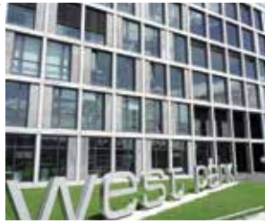
Akamai Technologies, Inc. 1,100 m 2 Pfungstweidstrasse 60, Zurich