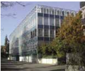
Rentenanstalt/Swisslife 3,000 m 2 Seminarstrasse 28, Zurich