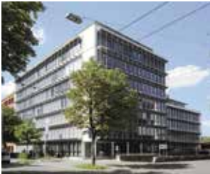
Allianz Suisse Immobilien AG 6,700 m 2 Hohlstrasse 552, Zurich