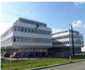
Alpine Finanz Immobilien AG 1,000 m 2 Flughofstrasse 54, Glattbrugg