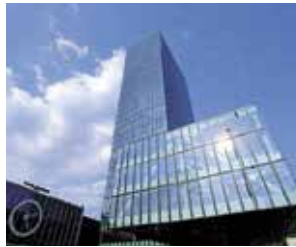
SPS Credit Suisse Asset Management 8,000 m 2 Messeturm, Basel