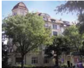
Google 3,000 m 2 Freigutstrasse 12/14, Zurich