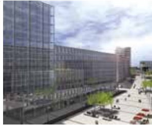
SBB AG 100,000 m 2 Stadtraum HB, Zurich