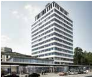
Konsortium Hochhaus zur Schanze 3,250 m 2 Talstrasse 61 + 65, Zurich