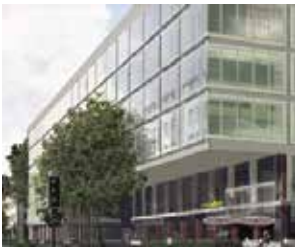
Bank Vontobel AG 4,000 m 2 Beethovenstrasse 19, Zurich