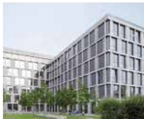
West-Park AG 30,000 m 2 Pfungstweidstrasse 60, Zurich