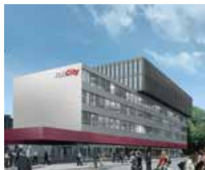
SBB AG, Bern 5,000 m 2 Bahnhofplatz 7, Winterthur