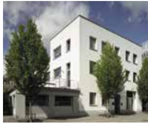
C. Capaul-Jost Erben 850 m 2 Neptunstrasse 96, Zurich